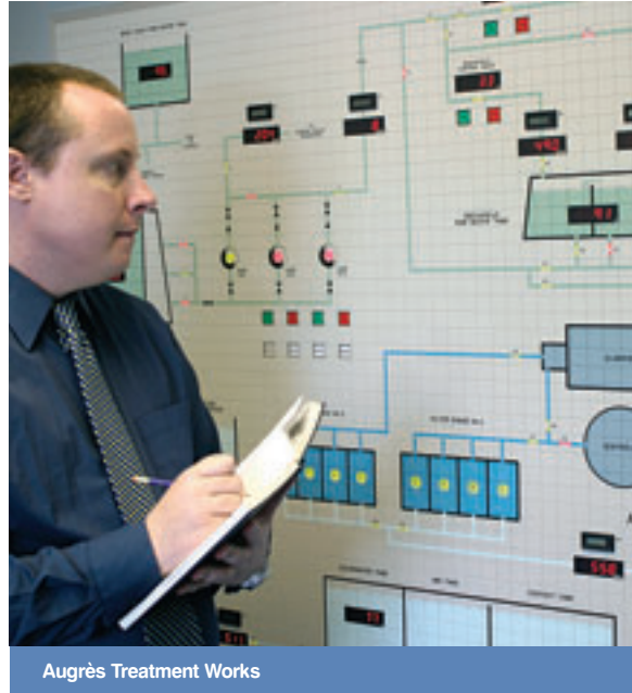
Overall compliance with the water quality Maximum Admissible Concentrations

Twenty nine non-compliant analyses were found in samples taken from the supply points and the supply zone during 2005, out of 18,388 analyses taken for compliance purposes. This gives a percentage compliance of 99.84%, slightly up on last years figure of 99.81%.