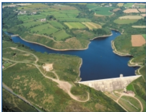
Val de la Mare Reservoir

Some 908 water samples were taken from stream sources and analysed for physical, bacteriological and chemical parameters. There were 24 herbicides and pesticides detected in water samples taken from the streams.